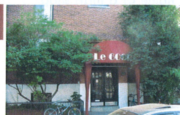
Front entrance of Le 6000

there are more to the Tams than just music. There are the endless rows of picnickers who are just tanning, drinking, or enjoying a good conversation. There are the games of pickup soccer, and even a large group, medieval-style battle staged under supervision in the valley in the forest right by the picnickers. So no matter what you're into, if you want to have a good time outdoors, the Tams is the place for you.