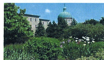
A beautiful view of the Gardens

province with their vibrant colours and serene atmosphere. With plentiful gardens of every variety and informative tours explaining the history behind the site, Les Jardins Des Hospitalitaire is a must see for nature lovers and historians alike.