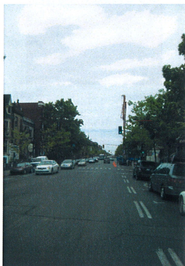
A view from the patio

Pote;tr is the unusual name of a thrift shop located at 6027 Parc Ave, right across the street from Le 6000. The name was meant to be a play on the French word Peut-être, which still does not seem to make sense as the name of a bargain store. They have all sorts of merchandise from books to clothes to shoes to bicycles. All at the low price you would expect of "used" items. Some are even free. (continued in middle of next column)